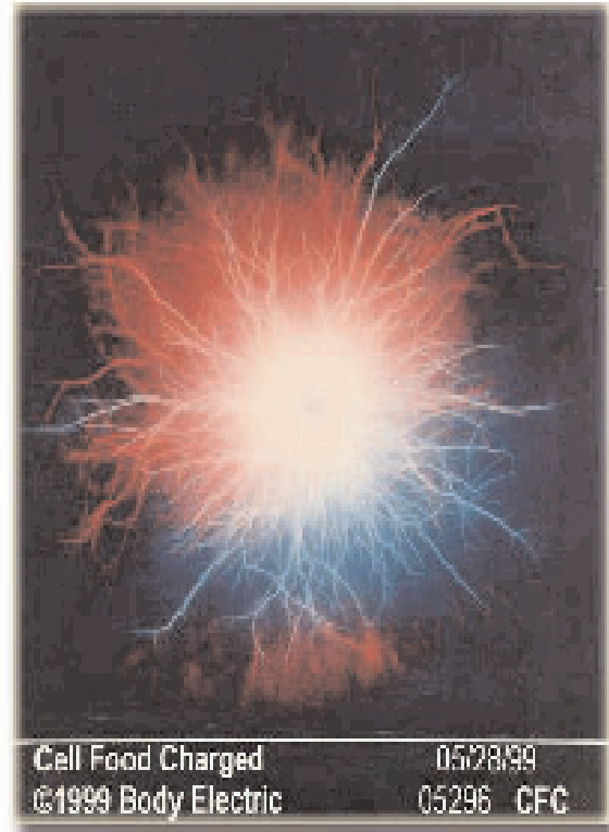
After EES exposure