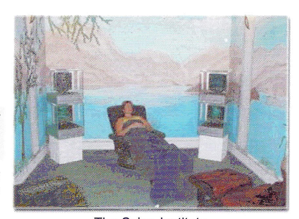
The Spine Institute 8 Unit EES in Palm Desert, California