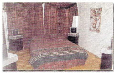
Put a system around your bed!